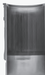
Severely Scuffed Liner